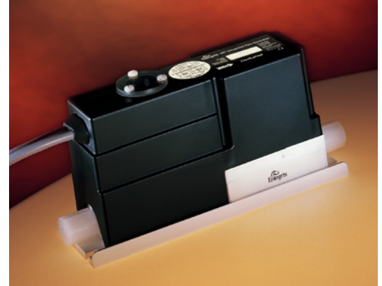
Figure 3: NT ® Integrated Flow Controller with DeviceNet ™ communication protocol.

The NT ® Integrated Flow Controller utilizes a differential pressure (DP) flow measurement, a high performance control valve and embedded electronics to provide accurate closed-loop control for in-situ monitoring and control of process fluid flow. High accuracy and repeatability allow users to optimize bath chemistry for immersion processes and fine-tune blend ratios for point-of-use chemical dispense applications.