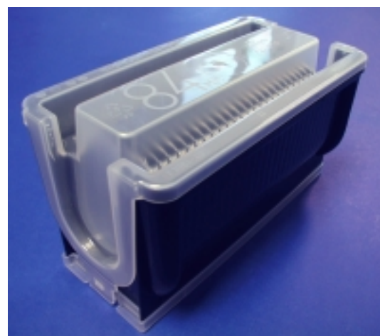
F10EVO™ with conductive PCR cassette

Entegris® and F10EVO™ are trademarks of Entegris, Inc.