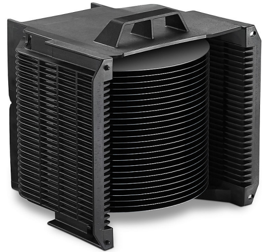
Open-side wall carriers designed for advanced wafer transport.

Trends in wafer processing technology have mandated advancements in wafer carrier technology to support today's advanced semiconductor processing facilities. Our 198/192 Series 200 mm wafer transport carriers address automation, contamination control, and productivity requirements for today's 200 mm fabs. These open-side wall wafer carriers, designed for advanced wafer transport, offer dramatic performance benefits over traditional low- and midrange wafer carriers, including precise wafer access, reliable equipment operation, and secure wafer protection.