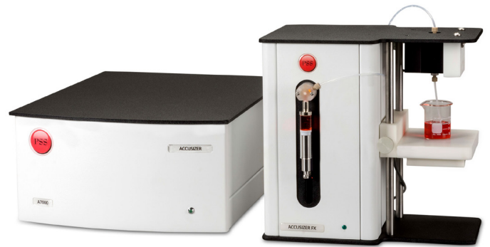
AccuSizer A2000 USP System

The AccuSizer software is a sophisticated package that automates USP <788> testing including pass/fail criteria and acceptance approval.