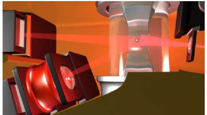
LE400 sensor principle