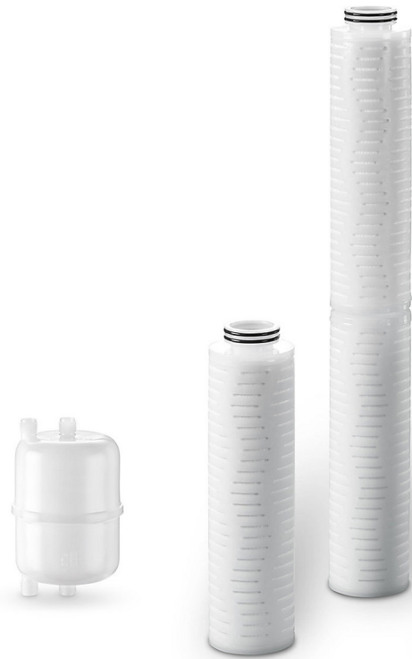
The Azora filter membrane provides superior contaminant retention.

*Not compatible with alkaline solution TMAH