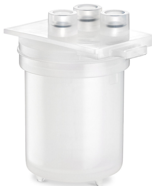
Eximor SV5 and SV5 Plus filters for sub-20 nm technology nodes