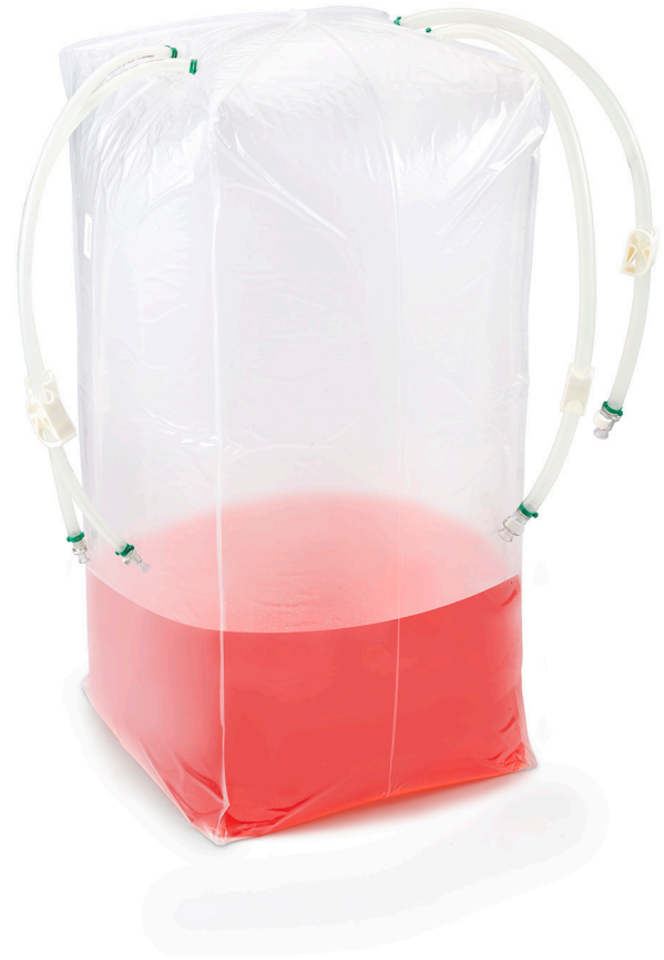
Custom sizes, configurations, and materials available to meet your needs