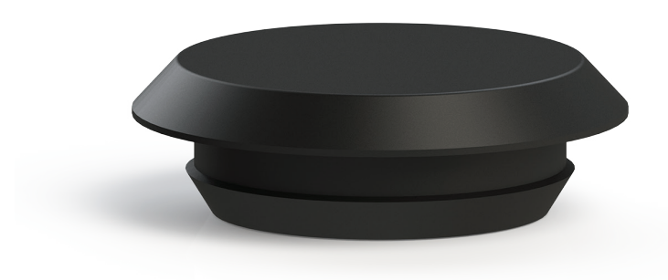
NA-65-100 SmartCap closure plug

The SmartCap™ closure plug is used to seal the SmartCap breakseal opening after chemical has been dispensed and the dispense connector has been removed from the SmartCap and NOWPak® liner-based bottle system. Residual chemicals are safely sealed within the NOWPak bottle.