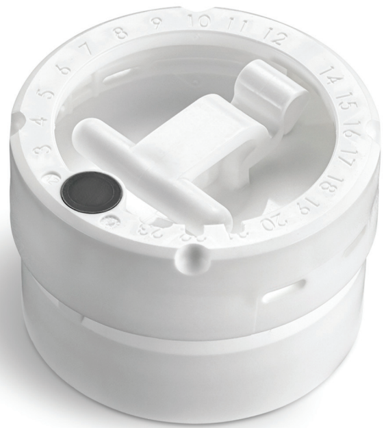
SCG-XX-YY-ZZ SmartCap Closure