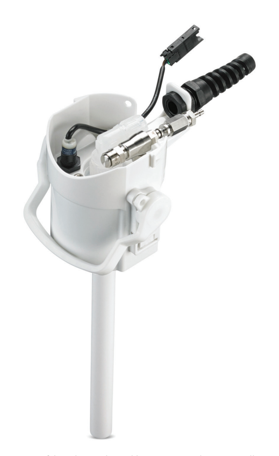
ErgoNOW connector safely and securely provides pressure assist or pump dispense