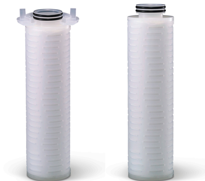
Panelgard with key and without key.

Point-of-use filtration of pigment-dispersed photoresist, acids, alkalis and DI water