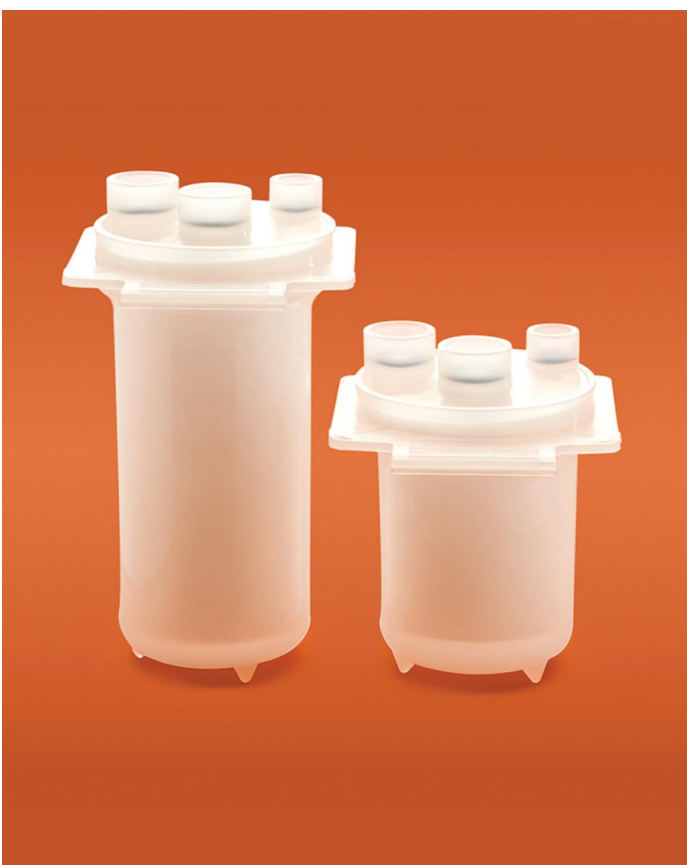
All-polypropylene media for broad process fluid compatibility