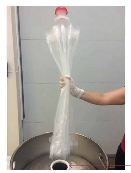
Liner insertion - tool

8. Place the liner insertion tool on the neck of the canister, then insert the liner.Note: Do not unfold the liner before inserting.