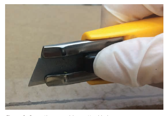
Figure 3. Correctly exposed box cutter blade.

2. Expose box cutter blade no more than 6 mm (0.24").