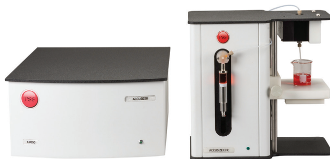
Figure 1. The AccuSizer SIS system

Parenteral drugs administered by injection to patients should essentially be free of visible particles. USP test 788, Particulate Matter in Injections, dictates how to quantify subvisible particles present in injectable drugs and sets acceptable particle concentration limits. Subvisible particles in parenteral drugs are detected using a light obscuration particle counter, microscopic inspection on a filter, or both. The majority of all USP 788 tests are performed using an optical liquid particle counter such as the AccuSizer (Figure 1). The particle limits for large volume drugs (>100 mL) are less than 25 particles/mL >10 µm and less than 3 particles/mL >25 µm.