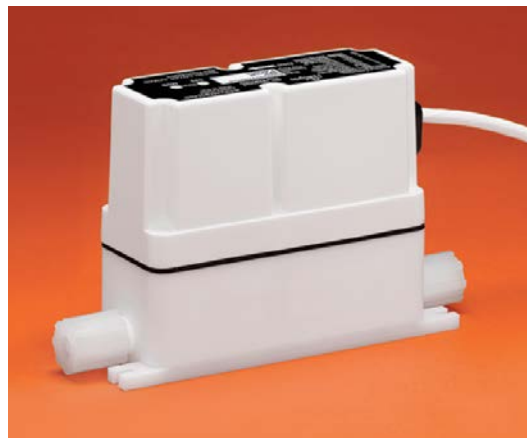
NT Integrated Flow Controllers control flow from 5 mL/min up to 40 L/min