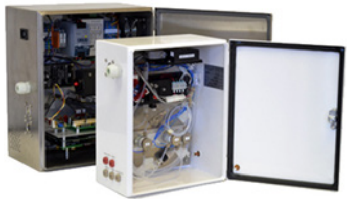
Figure 2. Optics/fluidics module