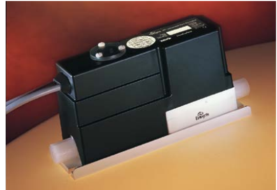
Figure 3. NT Integrated Flow Controller with DeviceNet communication protocol.