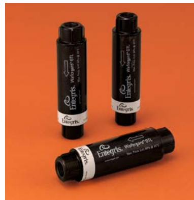
Wafergard GTL gas filters