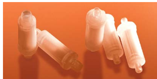
Wafergard GT-Plus gas filters