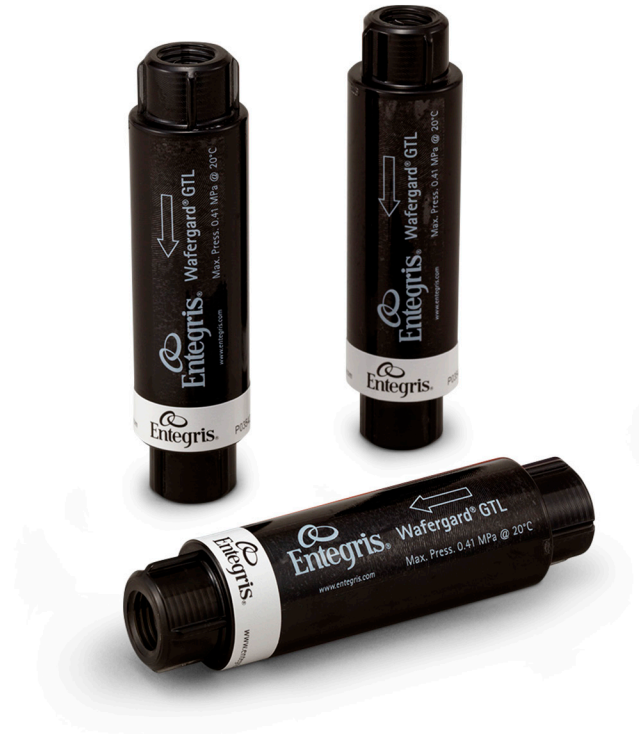
Wafergard GTL gas filters