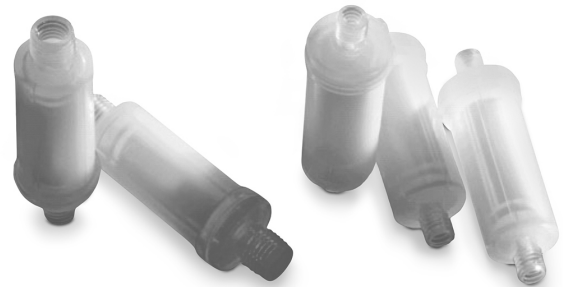
Wafergard GT-Plus gas filters