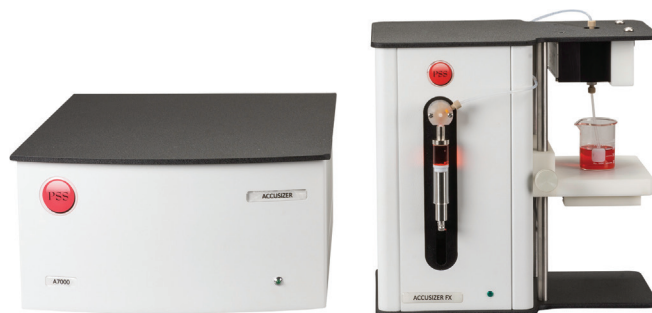
Figure 1. The AccuSizer SIS system

Parenteral drugs administered by injection to patients should essentially be free of visible particles. USP test 788, Particulate Matter in Injections, dictates how to quantify subvisible particles present in injectable drugs and sets acceptable particle concentration limits. Subvisible particles in parenteral drugs are detected using a light obscuration particle counter, microscopic inspection on a filter, or both. The majority of all USP 788 tests are performed using an optical liquid particle counter such as the AccuSizer (Figure 1). The particle limits for large volume drugs (>100 mL) are less than 25 particles/mL >10 µm and less than 3 particles/mL >25 µm.