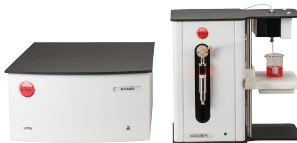
Figure 1. AccuSizer SIS system

The AccuSizer A2000 SIS (Figure 1) is specifically designed for customers performing USP <788> particle testing.