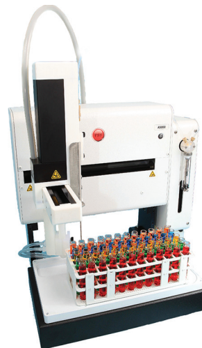
Figure 4. AccuSizer Autosampler

USP <788> testing can be fully automated using the AccuSizer Autosampler, Figure 4. Load the samples into the tray, program the system with the desired protocols and let the system process the entire tray automatically.