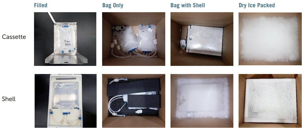
Figure 1. Shipping configurations

Images of the materials and configurations that were the subject of this study can be seen in Figure 1. Details of bag fill volumes, shipper size, and dry ice packing quantity are listed in the accompanying table.