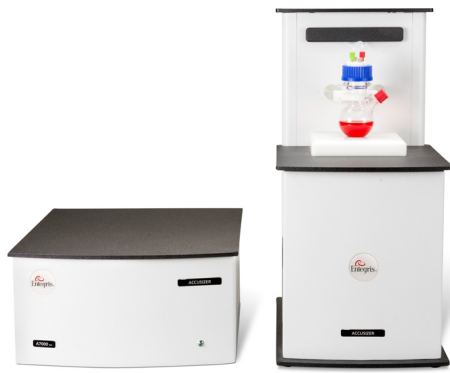
Figure 2. AccuSizer AD

This process creates microbubbles similar to the FDA approved Definity perflutren lipid microsphere injectable suspension marketed by Lantheus Medical Imaging, but with a different lipid formulation.