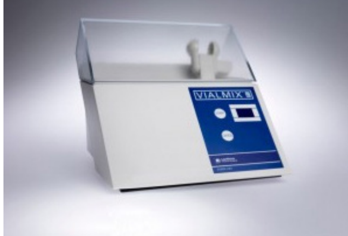
Figure 1. Lantheus Vialmix

CRPPR is a Neuropilin-1 (NRP1) targeting peptide. NRP1 is a receptor for vascular endothelial growth factor and its expression is up-regulated in multiple tumor types, as well as on tumor vasculature. Microbubbles prepared at the Ferrara Lab were used