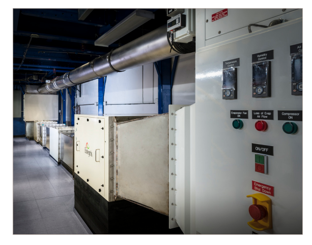
Entegris filter test wind tunnel.

The HVAC industry often tests filters at concentrations as high as 1000 parts per million (ppm, 10^{-6} ). Many AMC filter vendors test filters (or sometimes only adsorbent samples) at concentrations between 3 and 100 ppm. The ISO standard 10121-1:2014 suggests a range of 9 – 90 ppm, all far above real-world applications, which might be as low as a few parts per billion (ppb, 10^{-9} ), a factor of 1000 – 100000 below these test concentrations.