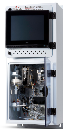
Advanced systems for automated online particle size and/or counts analysis.