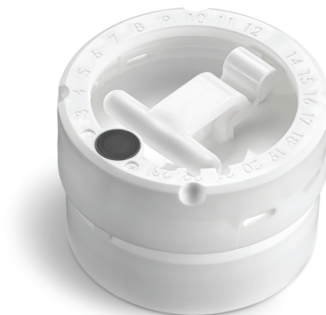
SC-XX-YY-ZZ SmartCap Closure